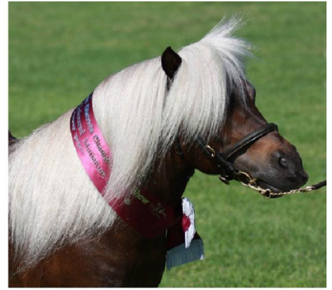
WESTEND EGYPTIAN PRINCE CHOCOLATE TAFFY STALLION