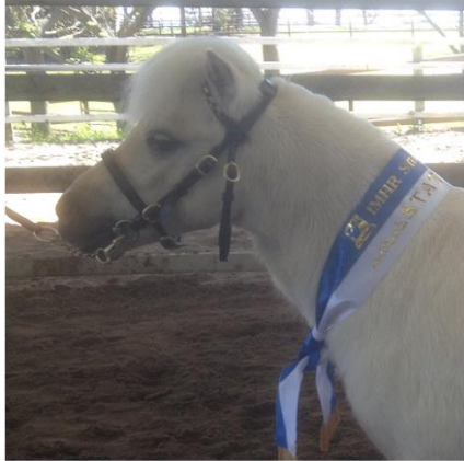
MY GRAND GOLD RASCAL