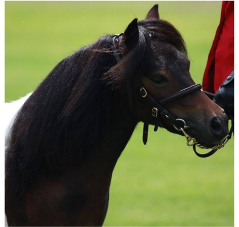
MY GRAND BANDIT

BREEDING QUALITY AMPS REGISTERED MINIATURE PONIES EMAIL : grandpma@hotmail.com PHONE : 0417659453