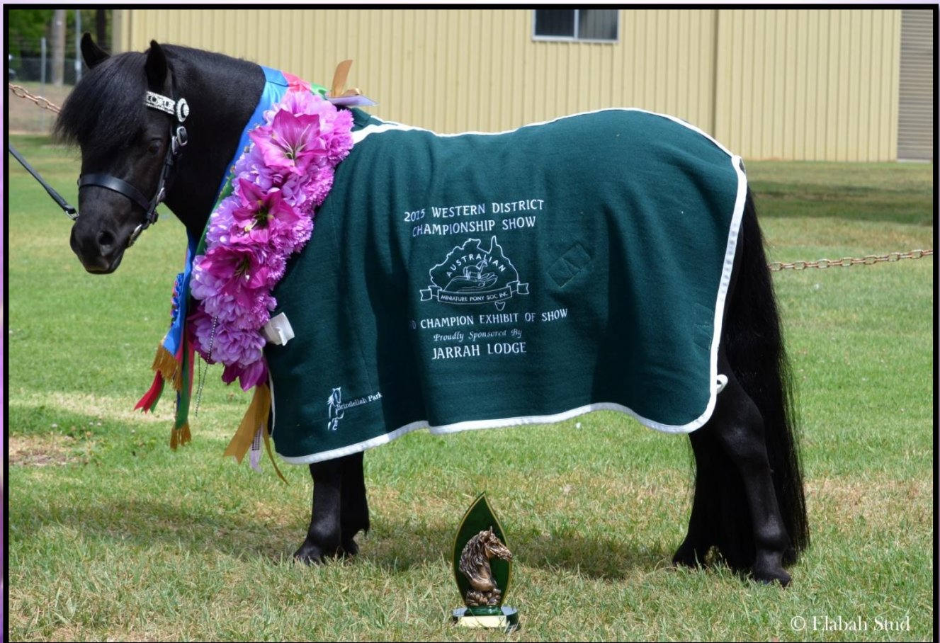
2015 Grand Champion - Dunmovin Lodge Original Sin