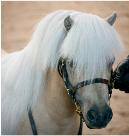
SANBAR LIBERTYS GOLD PALOMINO STALLION